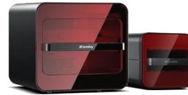
ProCure 2 / NanoCure